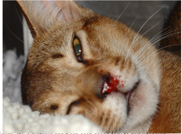
Figure 2b: Epistaxis can be seen secondary to hypertension